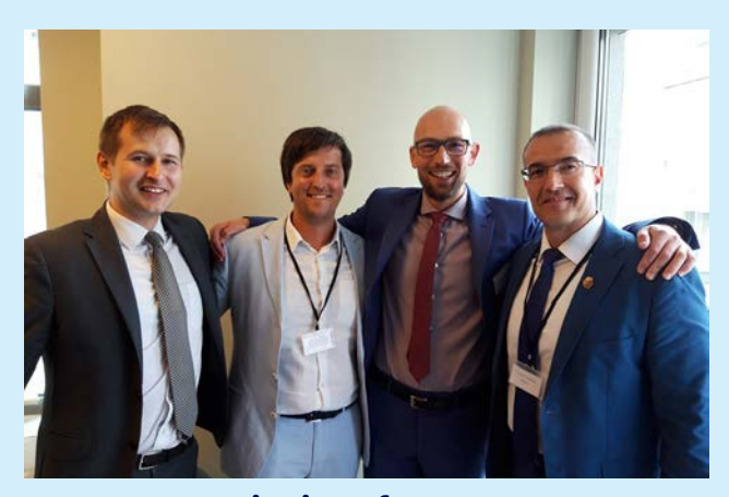
Twinning of Lawyers Gdańsk, July 2019

•Amendments to the Statutes made in 2017 opened membership for lawyers and entities from jurisdictions out of the European Union. •We increased visibility of the AEA-EAL by updating layout and content of the newsletter (3 editions were issued in the previous year in four languages each: French, English, Russian and Polish), website as well as enhancing our presence on Facebook. •We launched new section on AEA-EAL website: Papers. It consists of interesting materials, analyses and articles prepared by AEA-EAL members and our friends since December 2017. •Six conferences and seminars were organized - in Chisinau (Moldova) in April 2019 (partnership) on the "harmonization and appropriation of the national legislation with the European Community Acquis", in Edinburgh (UK) in June 2019 on challenges connected with use of Artificial Intelligence, in Gdańsk (Poland) in July 2019 - Twinning of Lawyers, in Tbilisi (Georgia) in Sep-